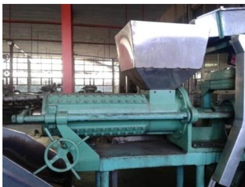
Figure 3. Rotorvane (RV) “15

This tool functioning For cutting, tearing and rolling shoots so that shoots can granular. On the CTC roll there are 2 rolls with different speeds. different. Roll 1 has speed of 70 rpm while roll 2 is 700 rpm. Roll 1 is the base while roll 2 is the base. cutter. Direction of rotation these two rolls is in the same direction. The distance between both rolls are 0.002 inch.