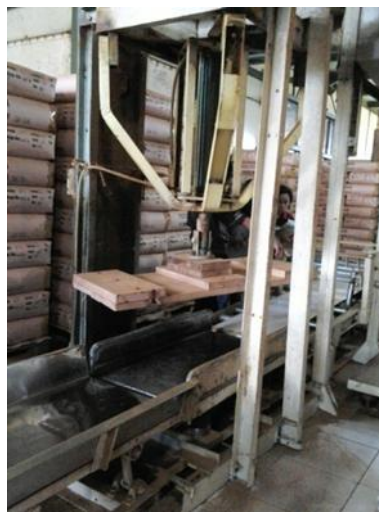
Figure 6. Bag Shaper

It is tool For leveling powder tea in a paper sack and arrange the thickness of the paper sack becomes not enough more than 20 cm. After the vibrator, the paper sack that has been filled tea placed on top of the bag shaper. In the section on top of the bag shaper there is iron as regulator height of paper sack. So that how thick is the paper sack ? more from 20 cm.