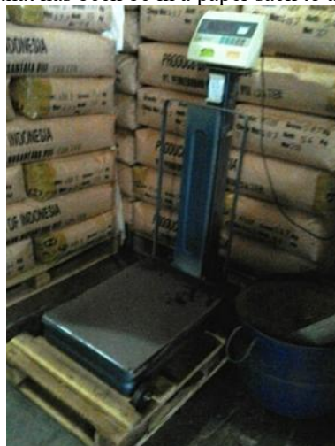
Figure 7. Scales

Vibrator is working For leveling tea dry to in all paper sack and collecting section tea dry fallen so that can used again. Scales functioning For weigh powder tea that has been in a paper sack to achieve desired weight.