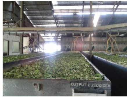
Figure 1. Tea Leaf Withering Process

It is a transfer process shoots from room withering to room milling. Extraction shoots withered with using barrels that are passed by colored monorails yellow. Then shoots entered to hallway towards GLS.